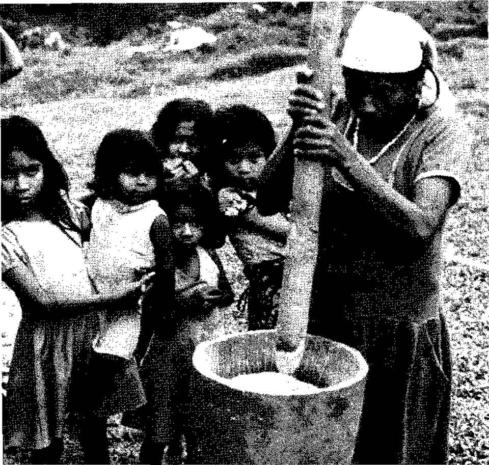
Miskitu woman hand mills rice to separate the chaff.