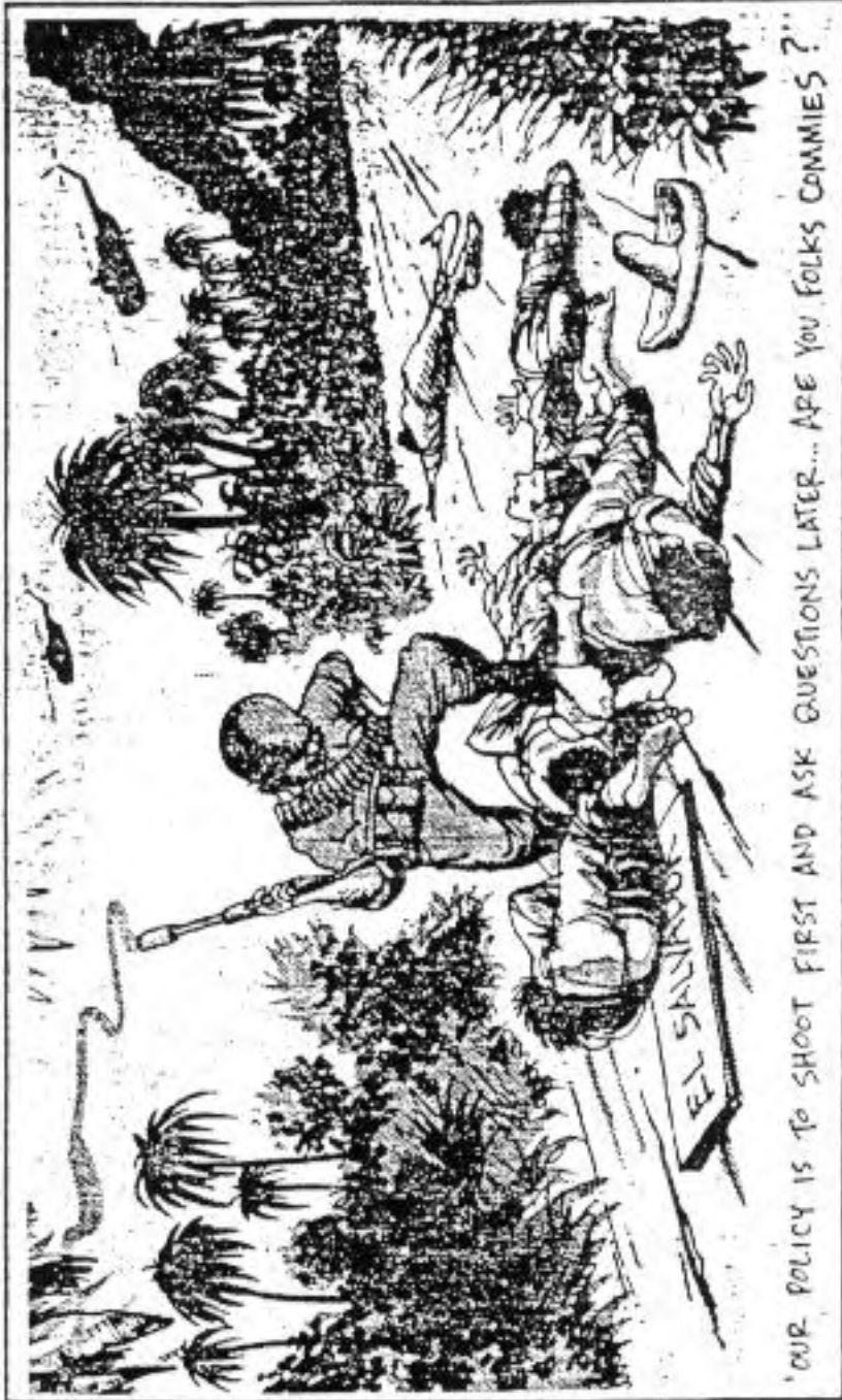
OUR POLICY IS TO SHOOT FIRST AND ASK QUESTIONS LATER... ARE YOU FOLKS COMMIES?'